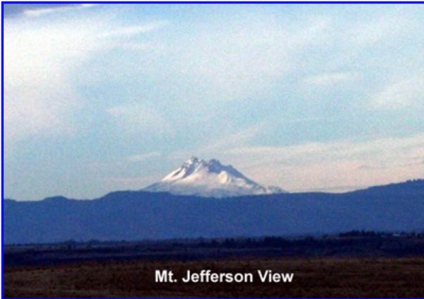
Mt. Jefferson View