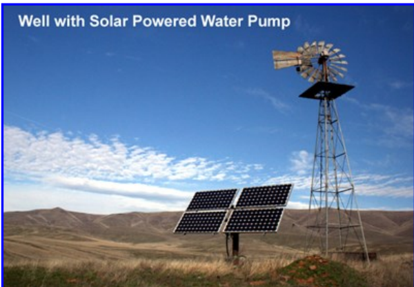
Well with Solar Powered Water Pump